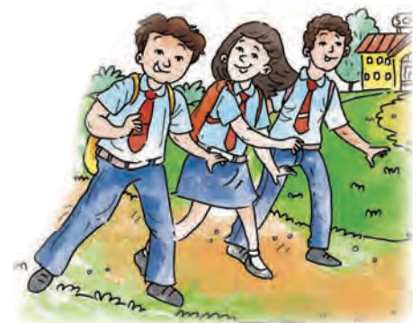
They are going to school.